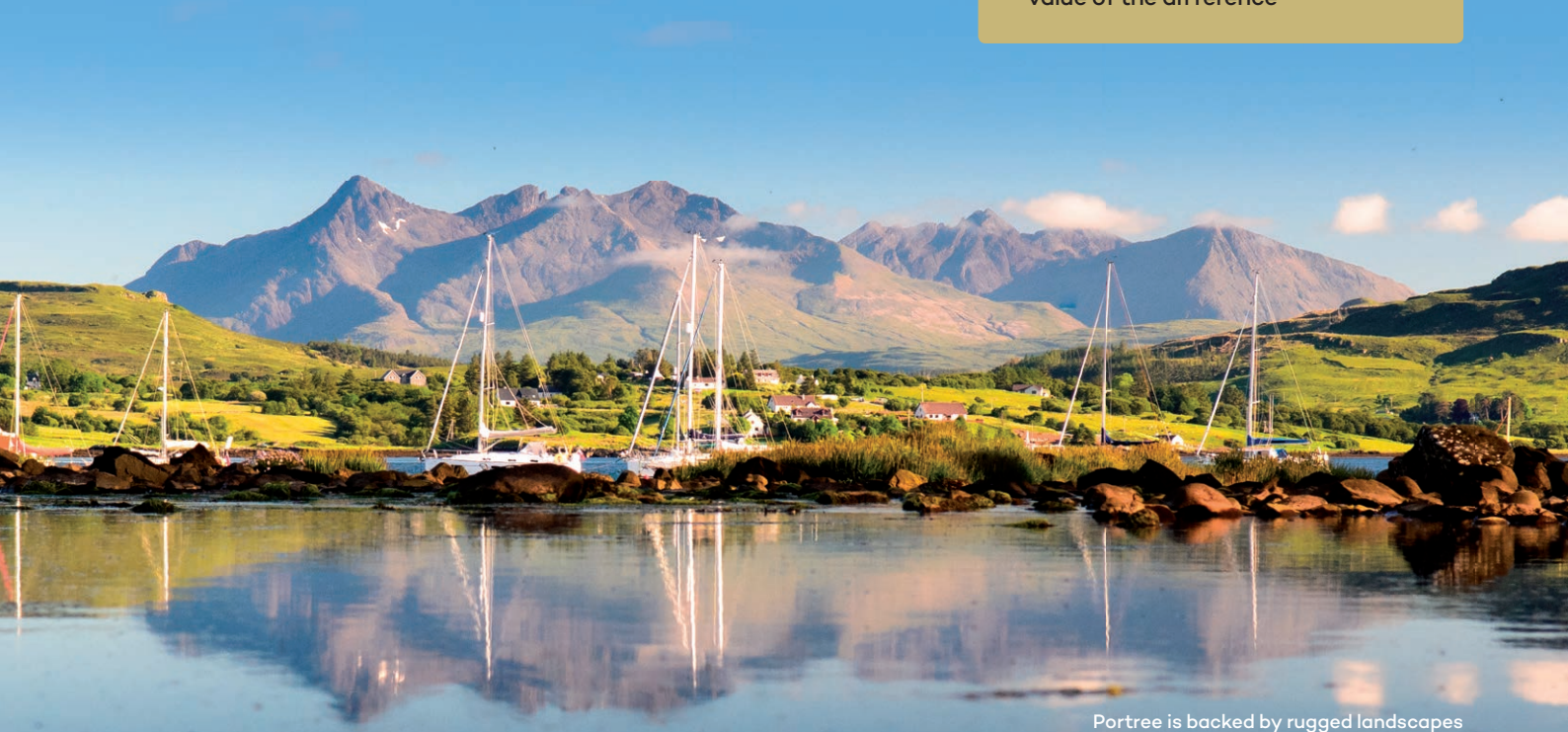
Portree is backed by rugged landscapes