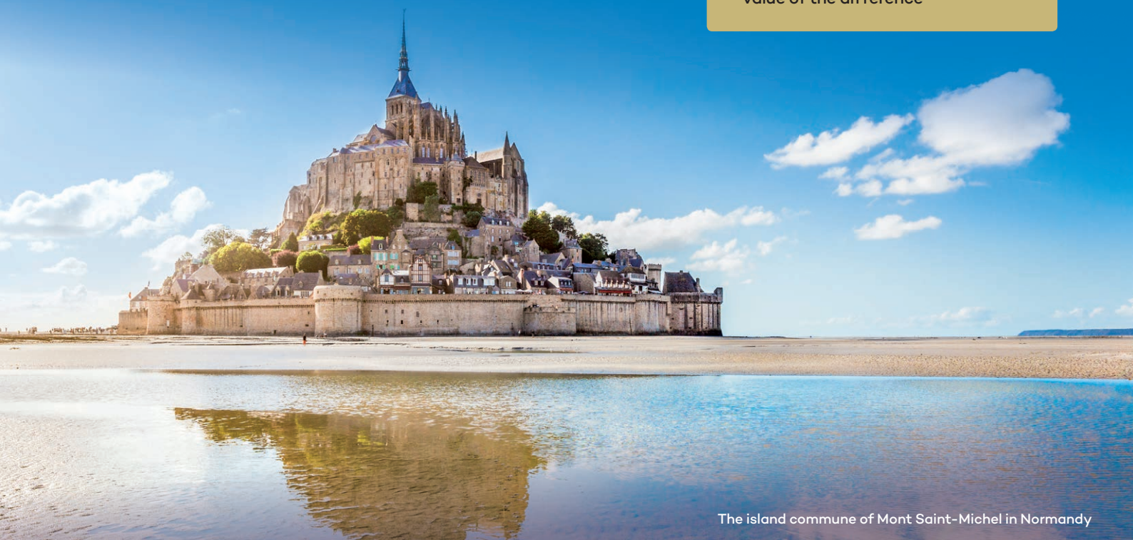
The island commune of Mont Saint-Michel in Normandy